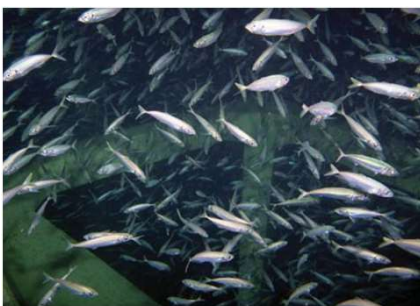
「Fish apartment !」

These artificial reefs are used properly according to the application such as the area and purpose, the type of fish you want to catch, and the depth of water to be installed.